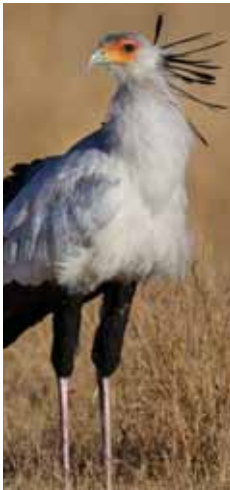
Secretarybird.