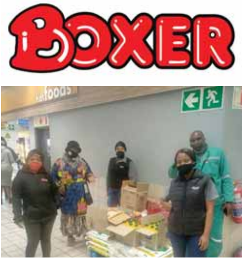
Oratile Day Care and Pre-School representatives collected much-needed food hampers from Boxer Rustenburg.